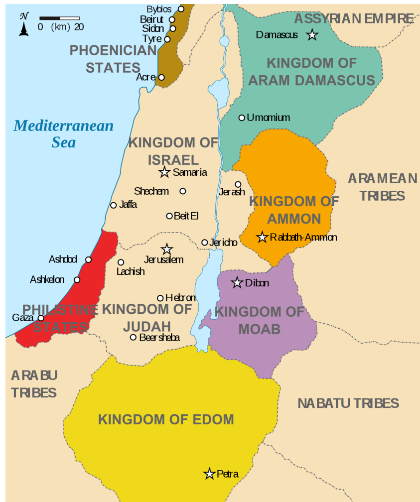
Map of the Kingdoms of Israel and Judah and surrounding Kingdoms